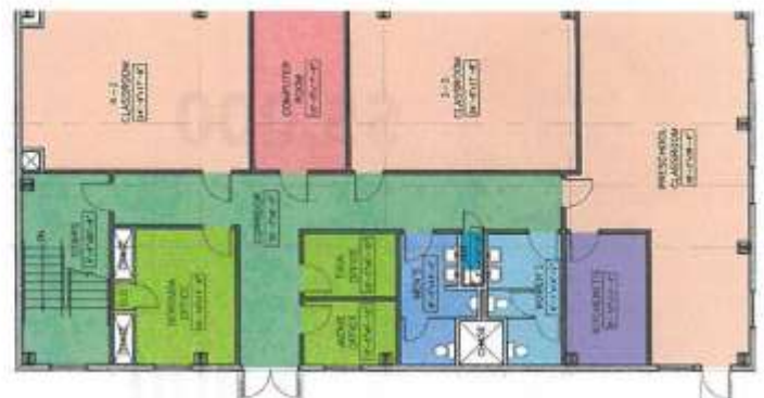
Main Floor ELM STREET ENTRANCE

They need a SAFE Place ALL UNDER ONE ROOF to learn about the power the Lord can provide for their daily situations, receive homework help, access to computers, healthy snacks and dinner, clothing, shoes, hygiene kits, groceries and the opportunities to learn valuable lessons about dealing with life.