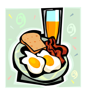
Men's Prayer Breakfast

All items for the bulletin and Power Point presentation must be into the church office no later than 9:00am Friday morning. January's newsletter deadline will be December 26th.